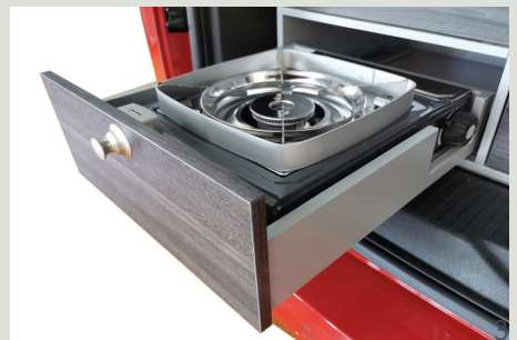
Pic. 3: Stove with 2 spare gas cartridges