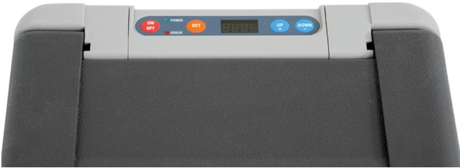
Pic. 8: Cooler box with digital temperature display