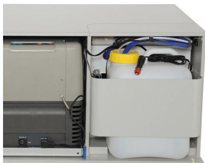
Pic. 2: water tank, kitchen backside